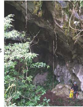
Entrance Views from above and below. Tony, above, and group, below